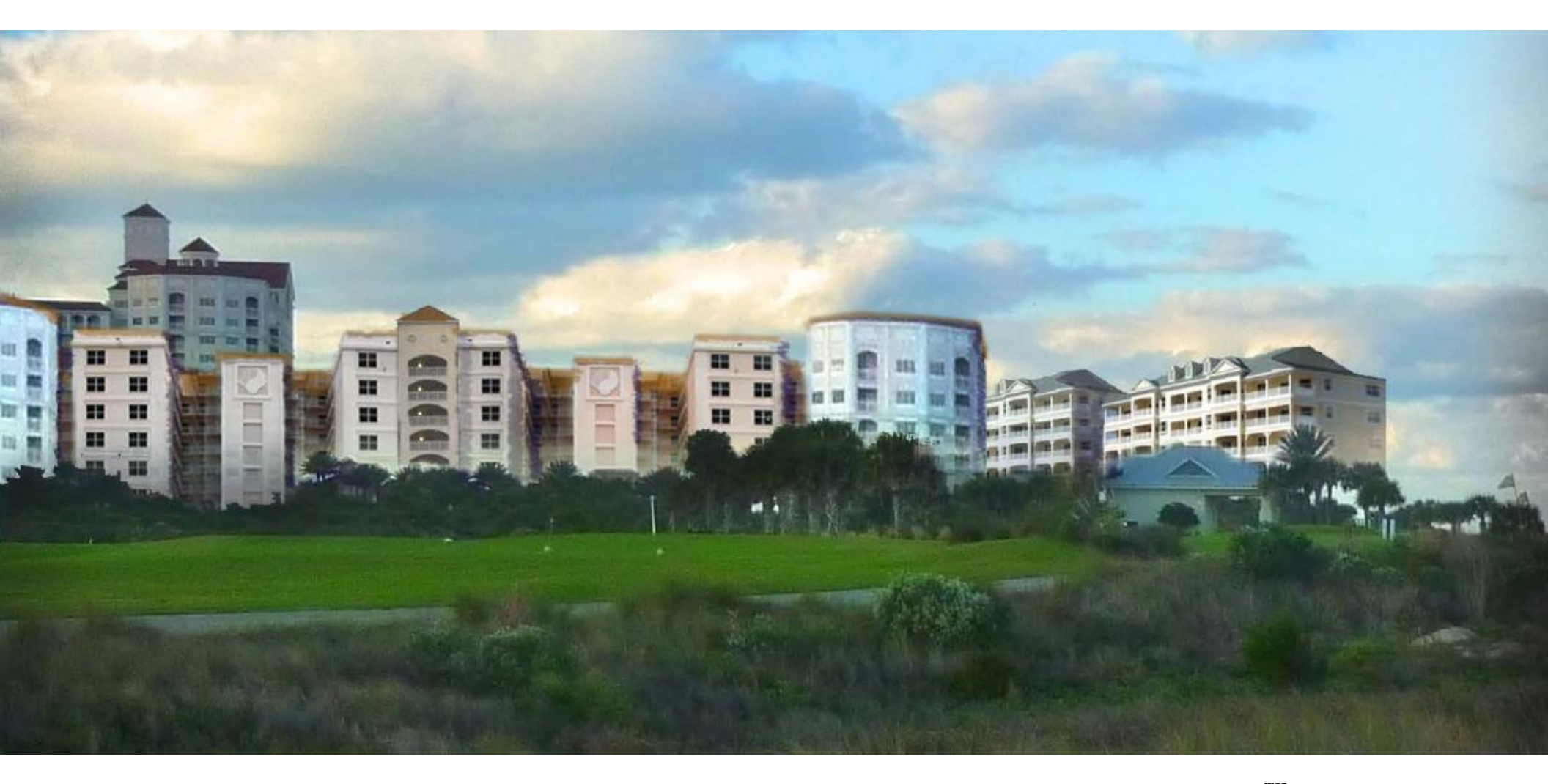
FIGURE 3B: VIEW OF PROPOSED CLUSTER 35 FROM SOUTH SIDE OF GOLF COURSE SOUTH OF 16^{\rm TH} ROAD WITH POTENTIAL DEVELOPMENT ALLOWED BY 77'FOOT HEIGHT LIMIT (AS MEASURED FROM GRADE ADJACENT TO BUILDING