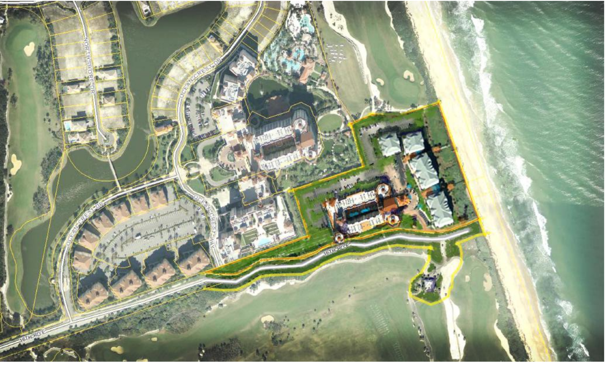
FIGURE 1B: ALLOWABLE/POTENTIAL DEVELOPMENT, PROPOSED CLUSTER 35. OCEANFRONT BUILDINGS BASED ON CINNAMON BEACH PROTOTYPE, WESTERN BUILDING BASED ON CENTRAL CLUB LAYOUT.