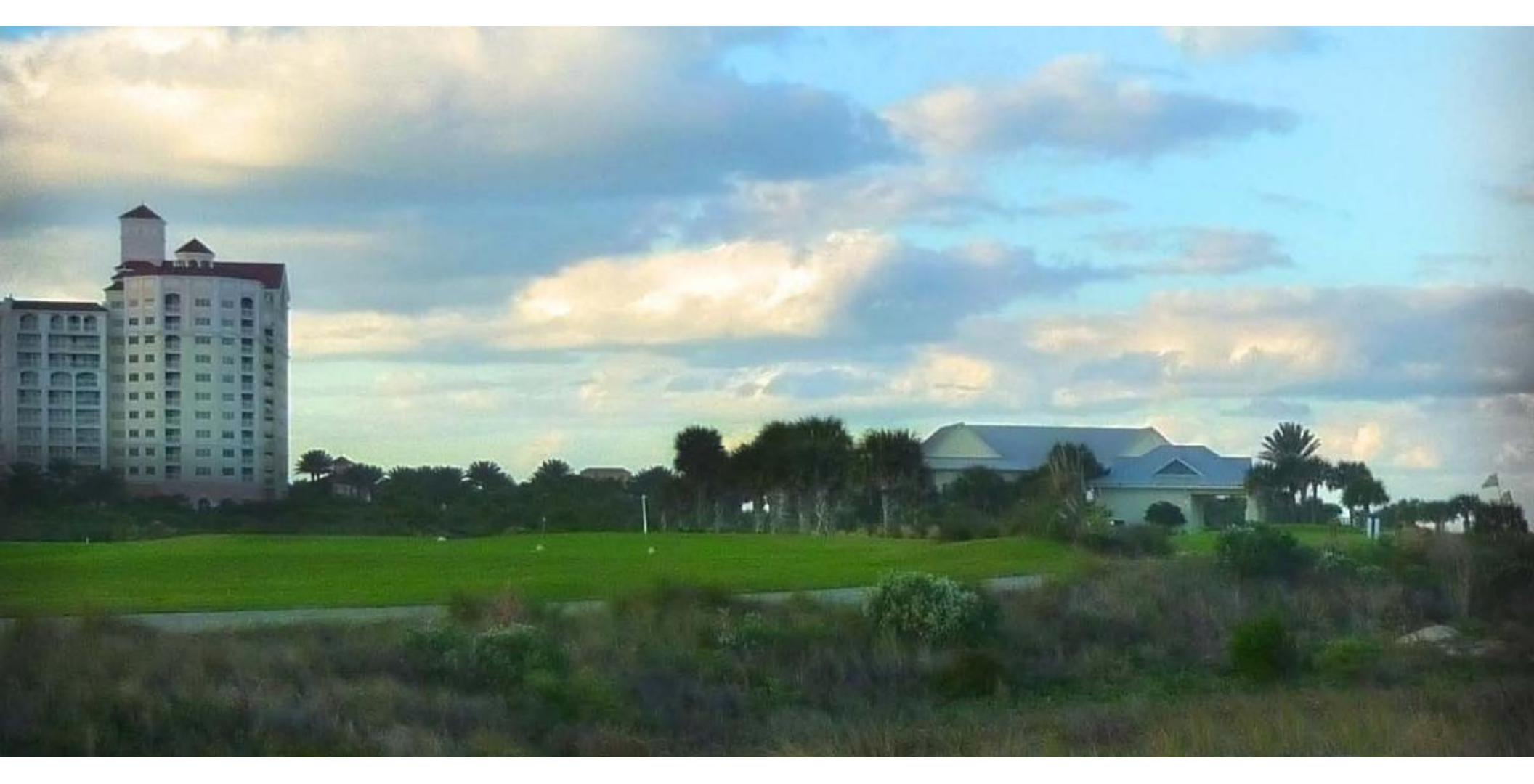
FIGURE 3A: VIEW OF PROPOSED CLUSTER 35 FROM SOUTH SIDE OF GOLF COURSE SOUTH OF 16<sup>TH</sup> ROAD (LODGE IS TO THE RIGHT). CART-HOUSE IS IN FOREGROUND RIGHT, APPROXIMATELY 640' FROM VANTAGE POINT. SOUTH TOWERS ON LEFT, APPROXIMATELY 1,1,50' FROM VANTAGE POINT.