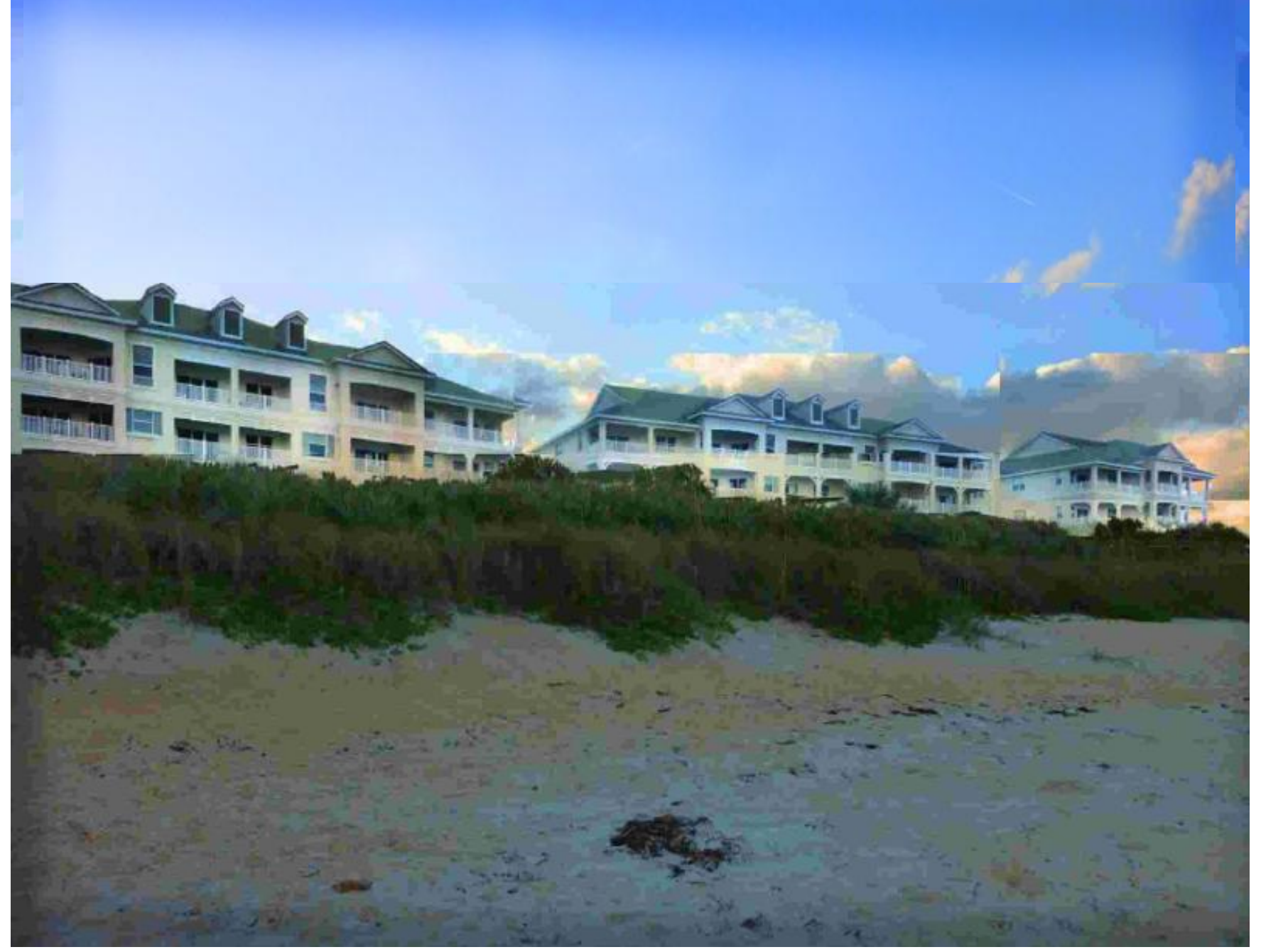
FIGURE 4C: VIEW OF PROPOSED CLUSTER 35 FROM BEACH (LODGE IN FOREGROUND, WITH POTENTIAL DEVELOPMENT ALLOWED BY HEIGHT LIMIT TIED TO LODGE ROOF PEAK HEIGHT(UNDER 64'/4 STORIES)