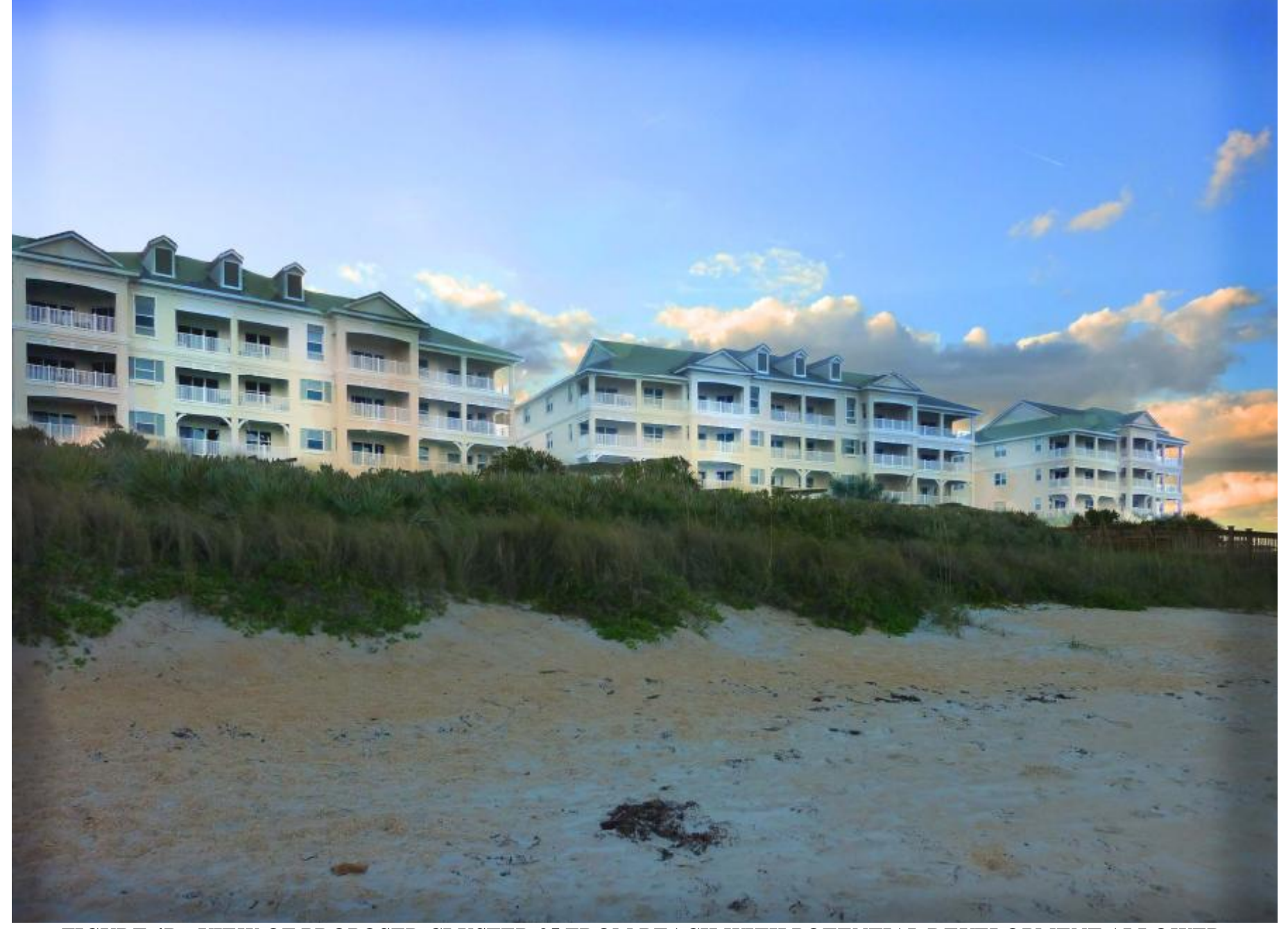
FIGURE 4B: VIEW OF PROPOSED CLUSTER 35 FROM BEACH WITH POTENTIAL DEVELOPMENT ALLOWED BY 77'FOOT HEIGHT LIMIT (AS MEASURED FROM GRADE ADJACENT TO BUILDING))