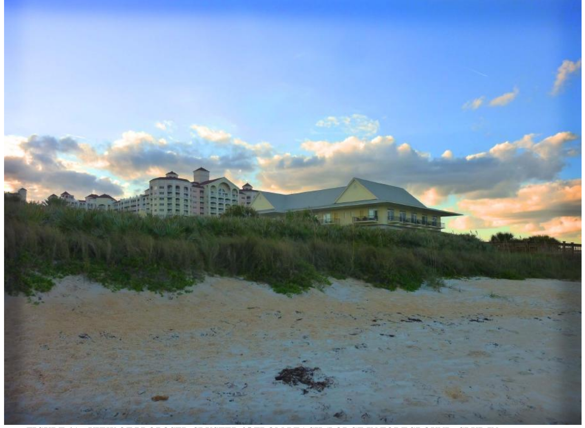
FIGURE 4A: VIEW OF PROPOSED CLUSTER 35 FROM BEACH (LODGE IN FOREGROUND, CLUB IN BACKGROUND)