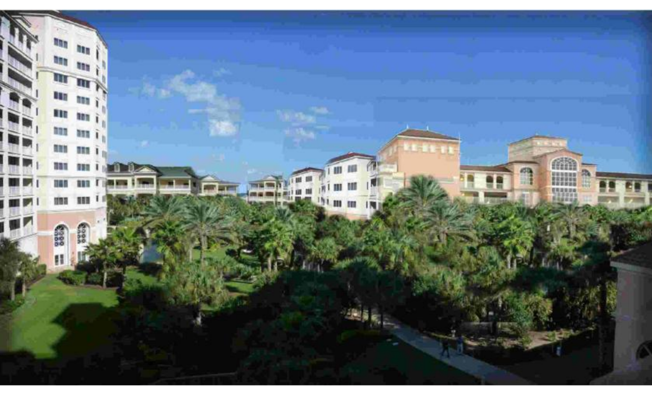
FIGURE 2C: POTENTIAL VIEW OF CLUSTER 35 FROM 3<sup>RD</sup> FLOOR SOUTH TOWER 3 WITH POTENTIAL DEVELOPMENT ALLOWED BY LODGE ROOF PEAK HEIGHT LIMIT (UNDER 64'/4 STORIES)