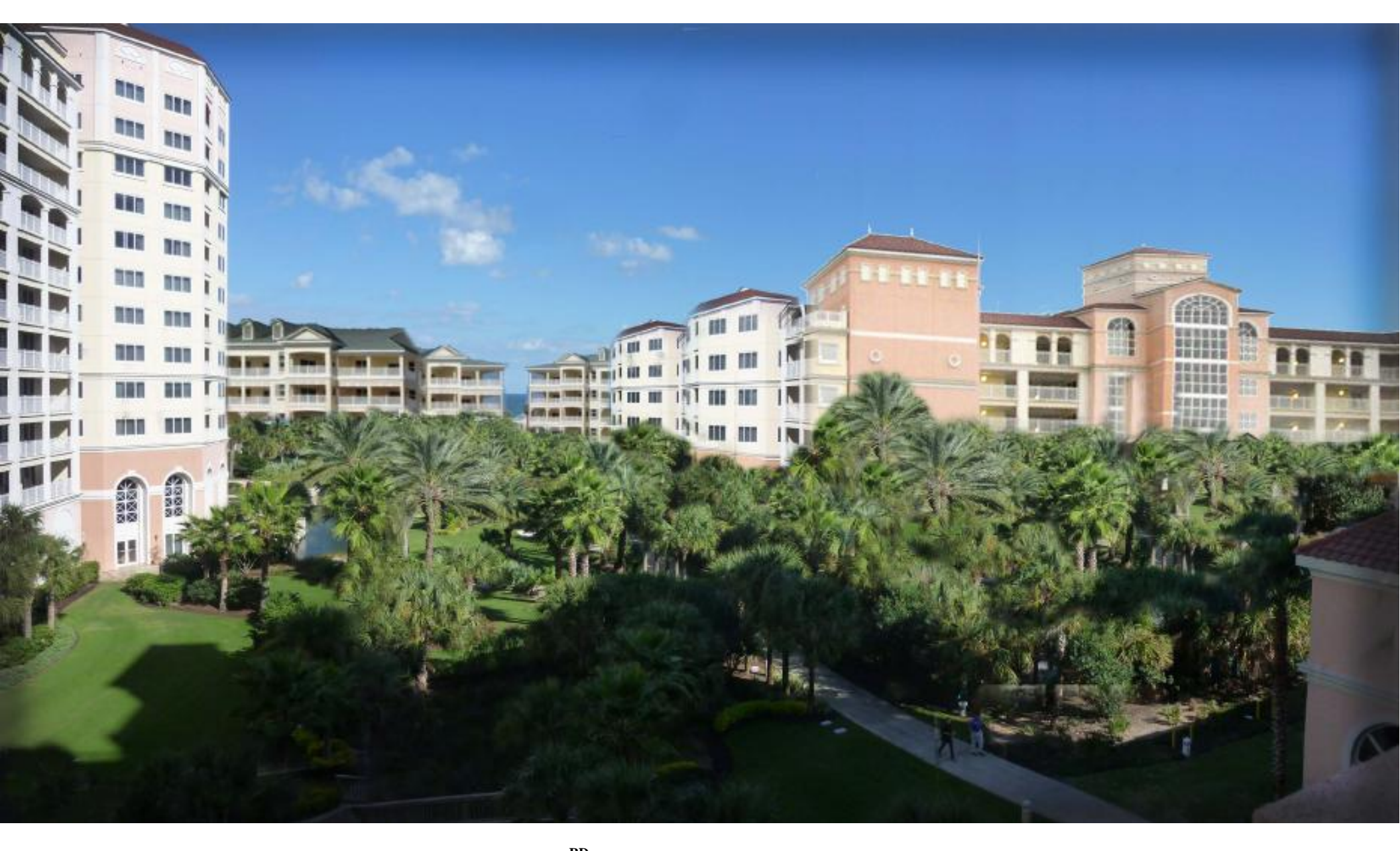
FIGURE 2B: VIEW OF CLUSTER 35 FROM 3<sup>RD</sup> FLOOR SOUTH TOWER 3 WITH POTENTIAL DEVELOPMENT ALLOWED BY 77'FOOT HEIGHT LIMIT (AS MEASURED FROM GRADE ADJACENT TO BUILDING)