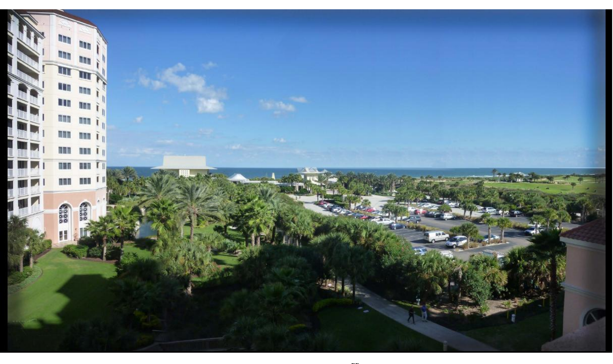
FIGURE 2A: CURRENT VIEW OF PROPOSED CLUSTER 35 FROM 3<sup>RD</sup> FLOOR SOUTH TOWER 3. LODGE IS APPROXIMATELY 600' FROM VANTAGE POINT. PARKING LOT IN RIGHT FOREGROUND, CLUB TOWER ON FAR LEFT.