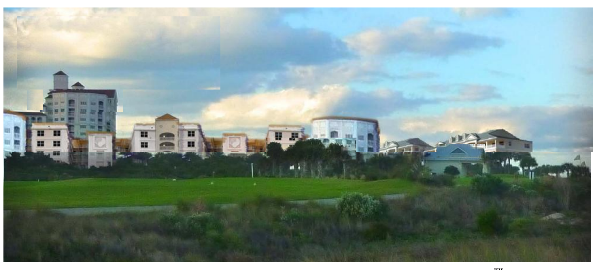
FIGURE 3C: VIEW OF PROPOSED CLUSTER 35 FROM SOUTH SIDE OF GOLF COURSE SOUTH OF 16<sup>TH</sup> ROAD WITH POTENTIAL DEVELOPMENT ALLOWED BY LODGE ROOF PEAK HEIGHT LIMIT (UNDER 64'/4 STORIES)